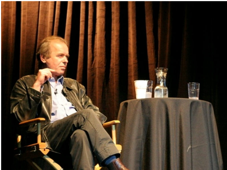
Above: Martin Amis, mid-discussion at the New Yorker Festival